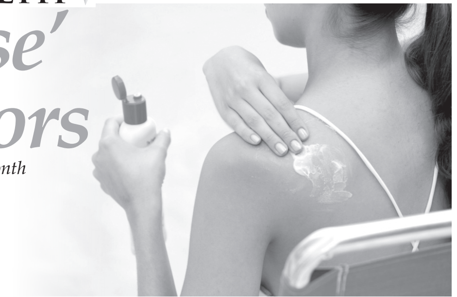
Generously apply sunscreen to all exposed skin using a SPF of at least 15, providing a broad-spectrum protection from both UVA and UVB rays.